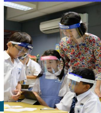
P3 English Lesson at Canossian School