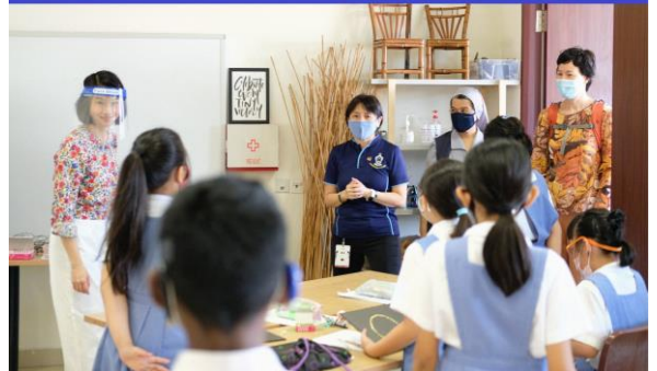
A visit to Canossian School and Canossa Catholic Primary School At Canossian School - Canossa Catholic Primary School Inclusion Programme