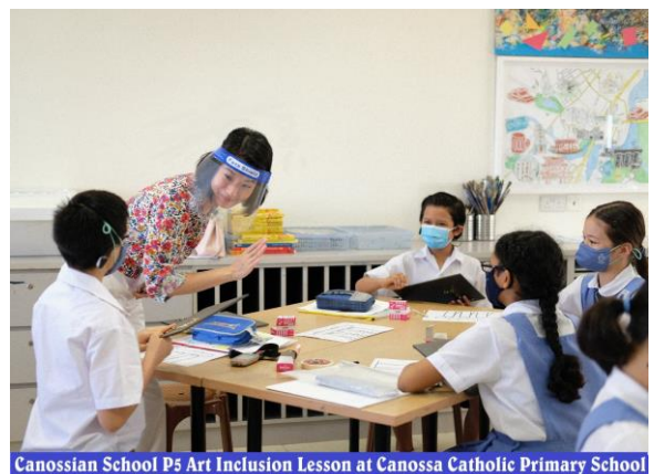
Canossian School P5 Art Inclusion Lesson at Canossa Catholic Primary School