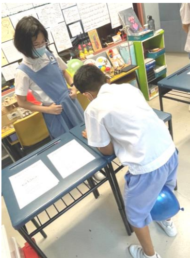
Speed and accuracy challenge