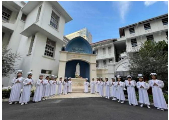
20 angels from CCPS, CS and the Spanish Community