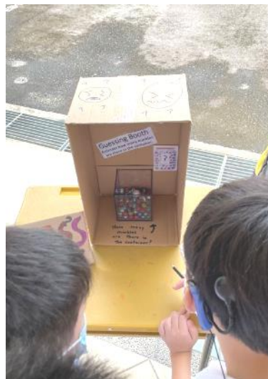
At the Guessing Booth