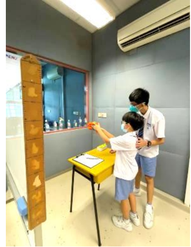
Number games with Nerf gun