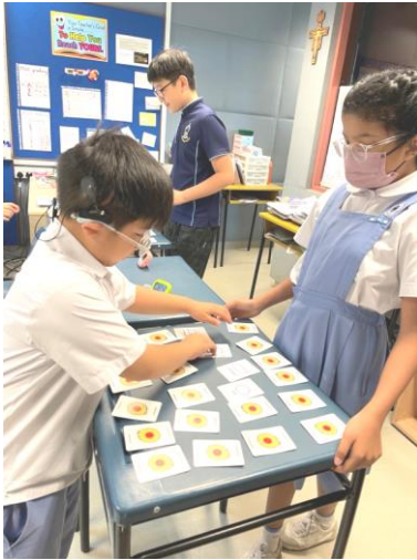
Matching geometric shapes

For Math Games Day this year, the Primary 1 to Primary 5 students were treated to 5 game stations. Different aspects of Mathematics learning were infused in game settings planned and run by the Primary 6s. Skills in numeracy, visualisation, memory and estimation were put to the test as students ventured from station to station. Teams comprising of members from different levels strived to attain speed and accuracy in solving problems, matching geometric shapes and building 3D structures with unit cubes. Students also got to estimate (guess) the number of marbles in a container at the guessing booth.