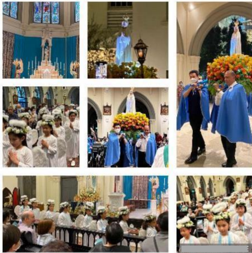
Mass and Rosary Procession