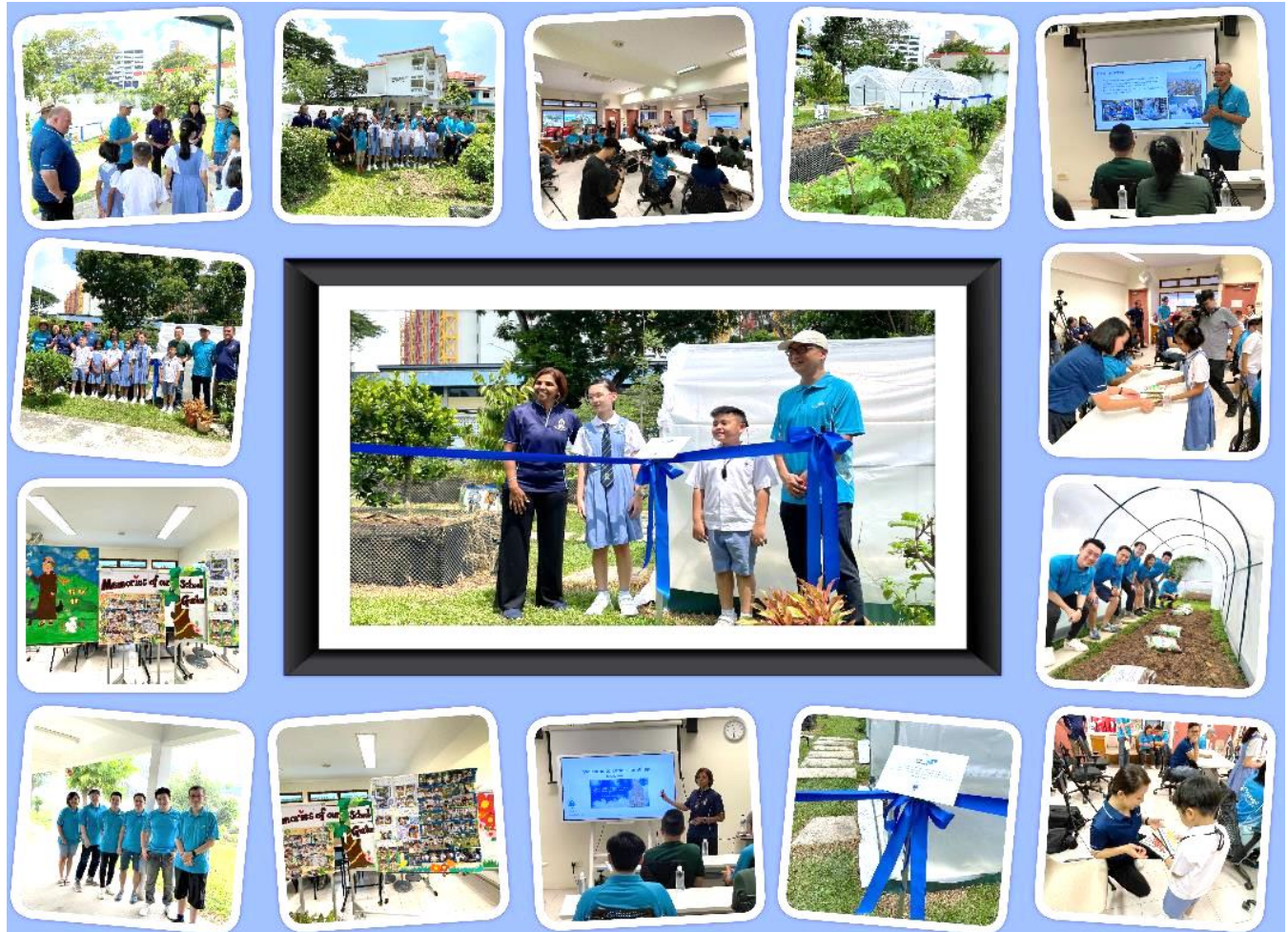
A photo collage of the event "Food for Taught"

Link to view the video clip ( https://youtu.be/mH4S53bOufw )