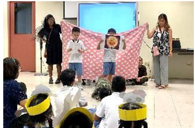
Pri 2 students dramatising 'The Hungry Caterpillar'