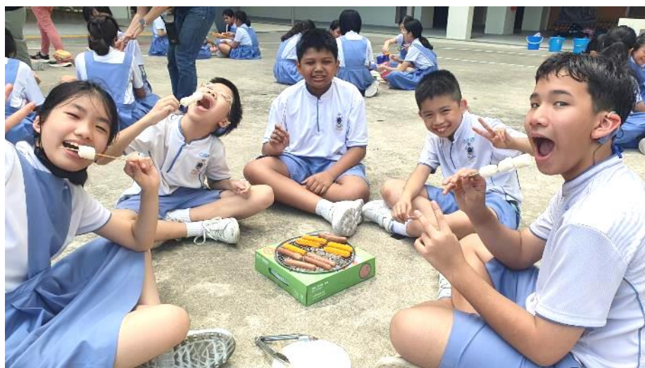
Pri 6 students take pleasure in barbecue