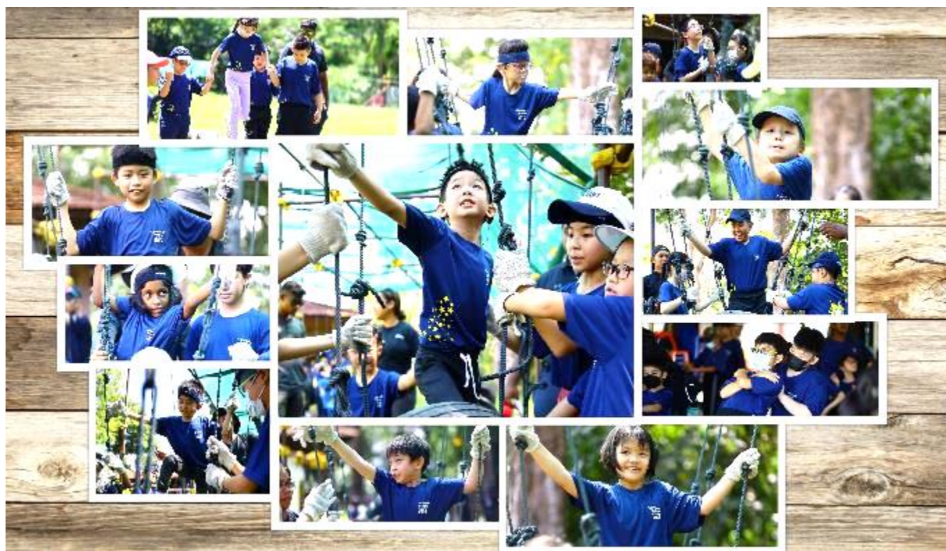
A photo collage of the school camp