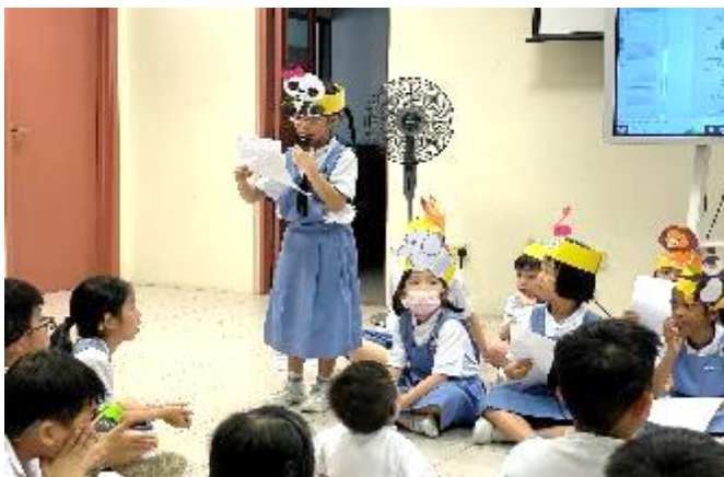
Pri 1 students sharing on animal facts