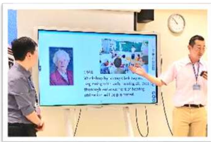
Our visitor from Japan, sharing about their educational experience