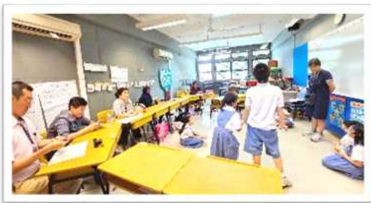
Pri 1 classroom observation by our visitors

The visitors attended sharing sessions by the Principals from both Canossian School and Canossa Catholic School. They had the opportunity to observe lessons at both schools as well as at Canossaville Preschool. In addition to classroom teaching, the visitors learned about the work of our therapists and watched them in action with our students. Discussions with various staff were a part of the programme to allow them to appreciate the full extent of provisions required to support learners accessing a mainstream education.