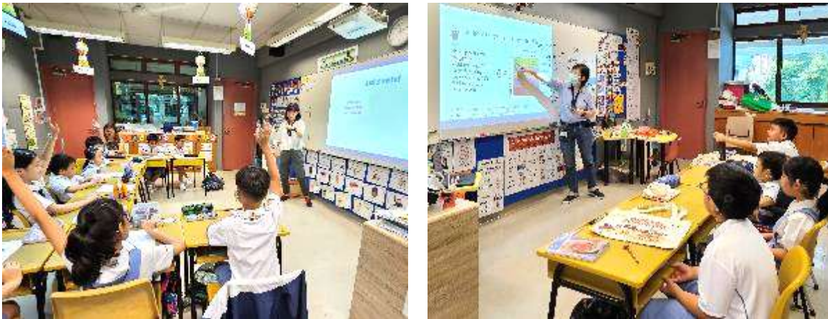
Our Pri 2 and Pri 3 students having their compensatory lessons conducted by our audiologists

These concepts are presented in a simple manner and vocabulary that their age group would be able to understand. These lessons allow our students to understand and communicate their needs to others confidently. What they learn in these lessons help them cope and excel in society even after they leave the school.