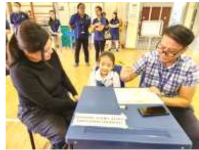
Parents creating a daily schedule with their child